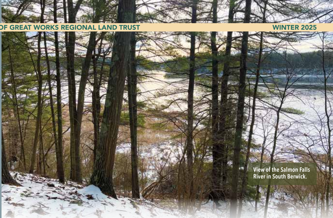
View of the Salmon Falls River in South Berwick.