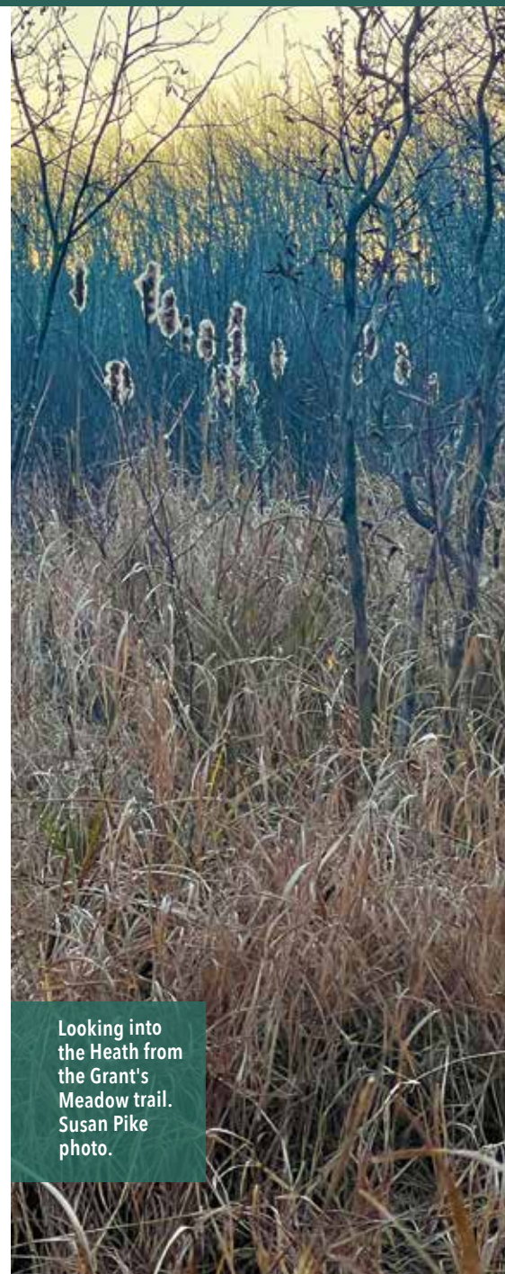
Looking into the Heath from the Grant's Meadow trail.