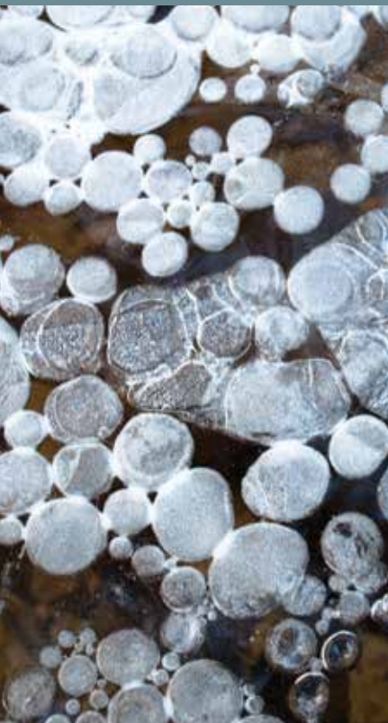
Ice bubbles in the water at the Negutaquet Conservation Area.