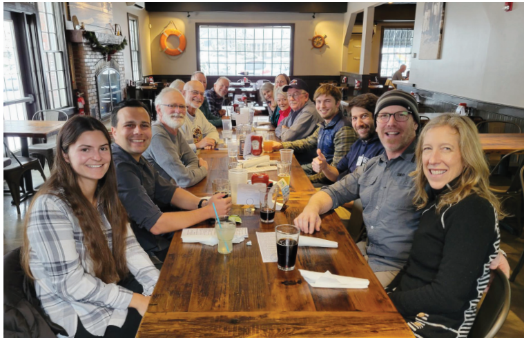
Land Stewards Appreciation Lunch at Brickyard Craft Brewery in Ogunquit