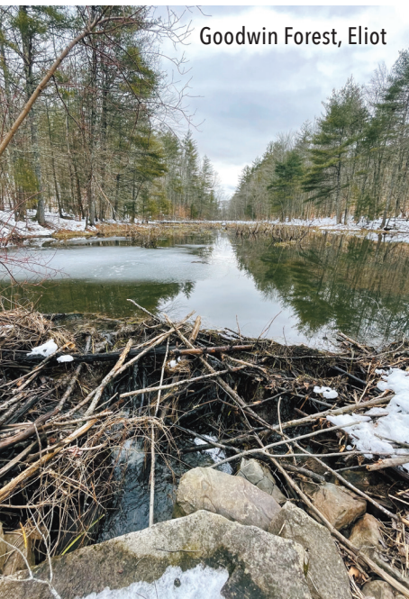
Goodwin Forest, Eliot