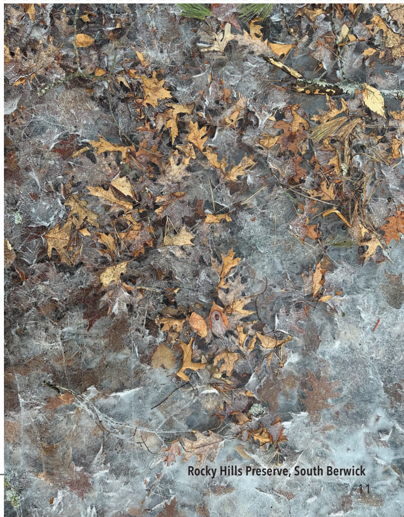
Rocky Hills Preserve, South Berwick