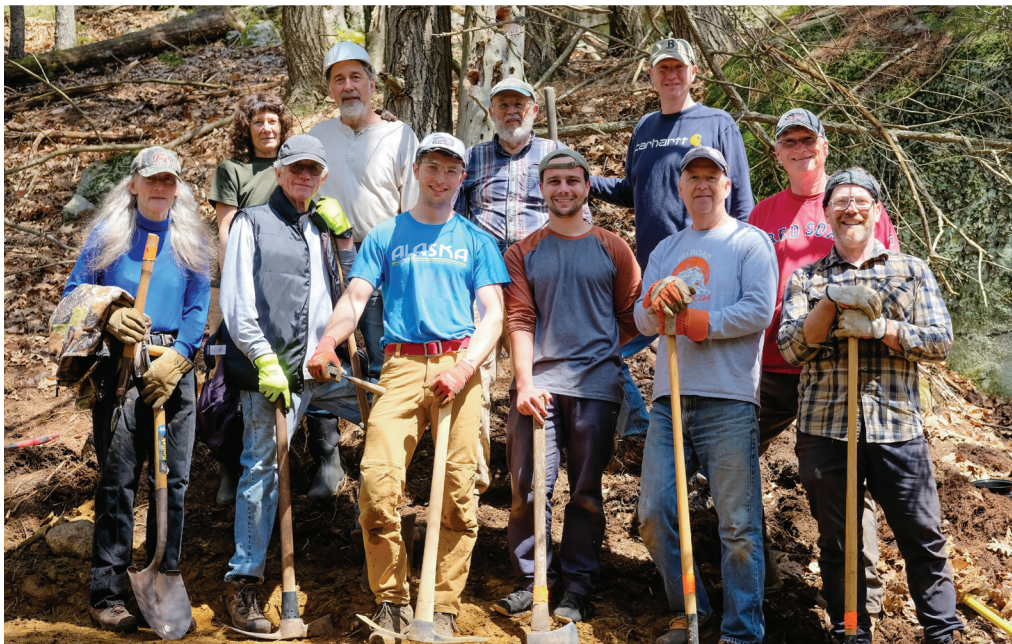
Orris Falls volunteer workday