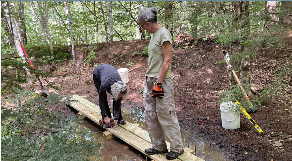
Bog bridge installation workday at Keay Brook

Special thanks to the Multiple Pathways Program at Noble High School, the Marshwood Interact Club, the Mary Hurd Academy, and the other volunteers who made the 2022 field season productive, enjoyable, and memorable. See you out on the trails!