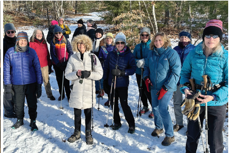
Wednesday Wandering at Negutaquet