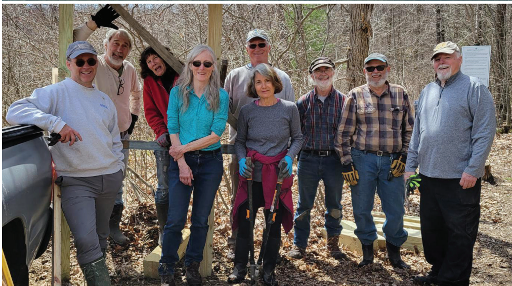
Newichawannock Woods Earth Day workday