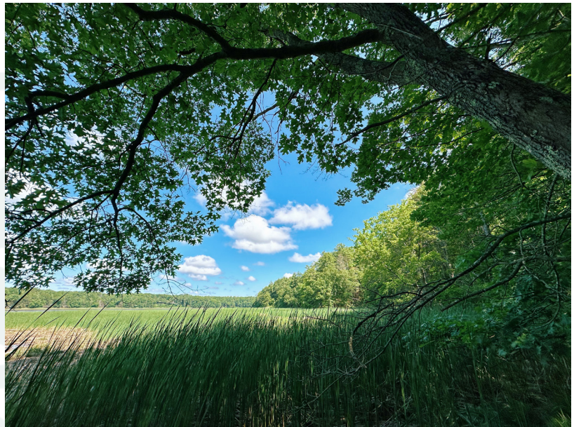
Forest Corridor Within The Salmon Falls Tidal Waters Project Site

This project sits just down the road from Vaughan Woods State Park, in South Berwick, ME along the Salmon Falls River within the Piscataqua River Estuary. This project will complement the State Park by providing more opportunities in this beautiful area of Maine. Conserving land in this area creates an opportunity for the protection of wildlife and habitat as well as coastal water resources, leading to coastal resilience, and climate adaptation. In an increasingly developed region, it is rare to find a shoreline and upland landscape that mirrors previous centuries.