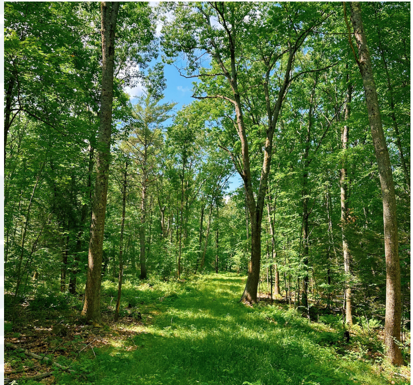
Forest Corridor Within The Salmon Falls Tidal Waters Project Site

The owners will continue with their development/sales plans. Public access will be lost. The undeveloped views from the River and the Rt 101 bridge will be lost. Important shoreline habitats will likely be degraded in their ability to support the wildlife and fish we have all enjoyed.