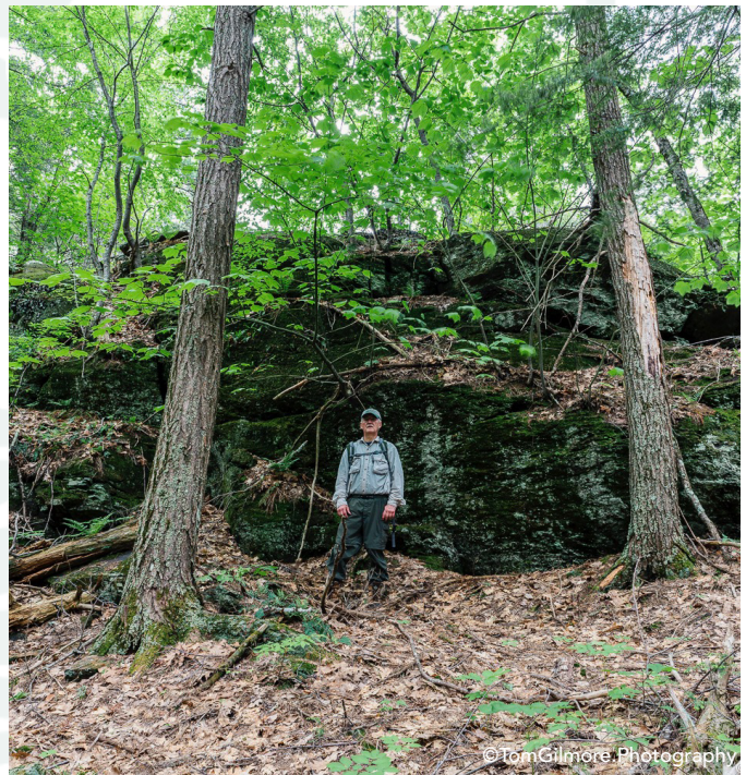
Ledges along Bauneg Beg Mountain