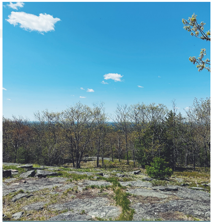
View from the open summit of Bauneg Mountain

We are seeking private contributions to this project that will support acquisition of land, trail building and long-term land management. To contribute funds or to get more information, please reach out to us by phone or email (see contact info below).